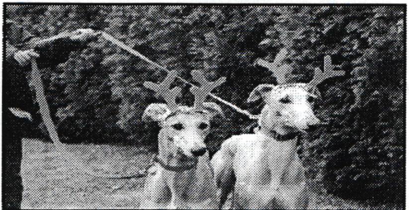
Sunny & Floyd - Don't they make a great pair of deers?

Each year we continue to do more "meet and greets" throughout the United States to promote greyhound adoption. Everyone in their own community can support N.G.A.P. by going to their nearest pet store and asking if they'd be willing to have a "greyhound day." They simply need to advertise that the greyhounds are coming to their store. We need a few adopters in the area to take their greyhounds to the event. The N.G.A.P. office will send you brochures, applications, and other items needed to pull off a great event. These are the kind of events that create more adoptions and better awareness.